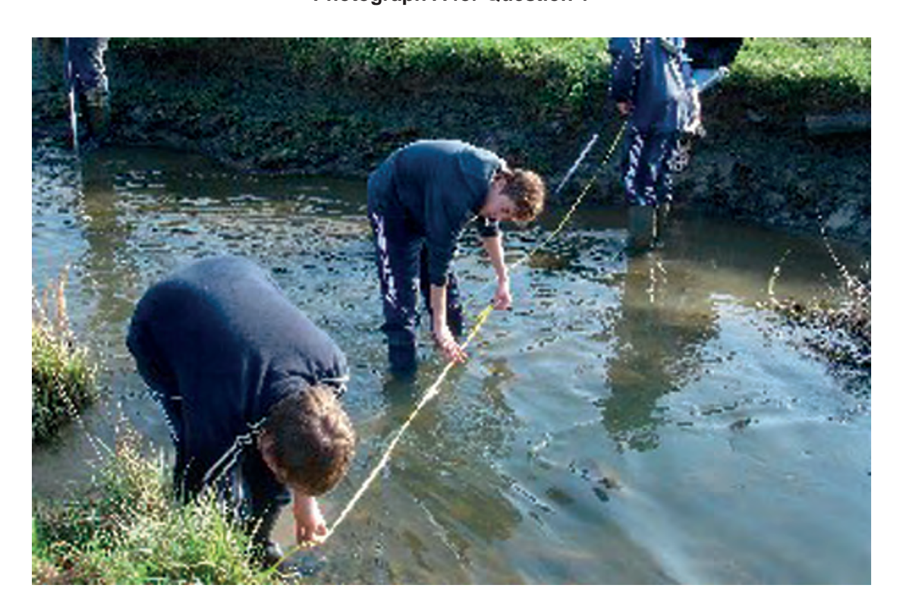
Photograph B for Question 1